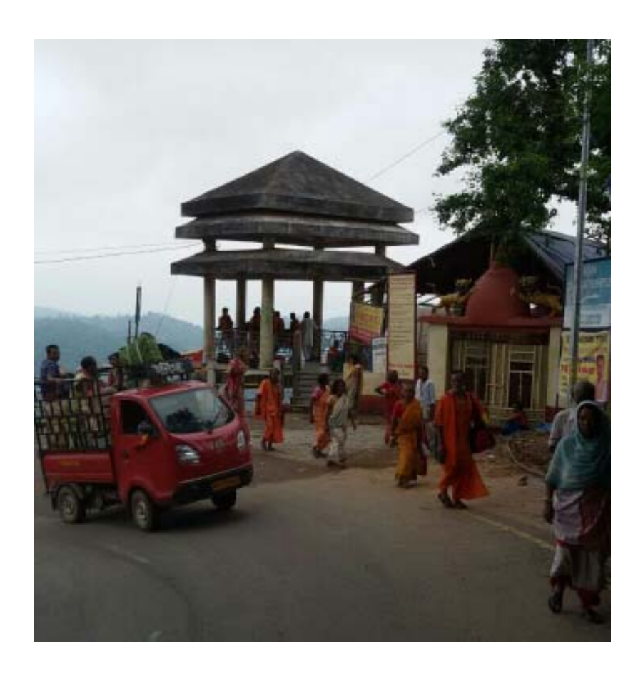
Fig 4: Watch tower constructed by ATDC in the region

India Ltd. is under Progress, the water tank constructed at the western rim of the hill, nearing the Western Gate and the Mahakaal Ganesh temple. Apart from that, a branch of the State Bank of India is established near the Kamakhya temple and 6 (six) numbers of ATM has been established for easy money transactions for both the local people and the tourists that directly and indirectly supports tourism industry. In addition a health care centre has been run by the Kamakhya temple management authority which provides free health care and first-aid facilities to the tourists. However, during the Ambubachi mela temporary first aid and health care centres are also established to give proper service to the lakhs of devotees and tourists every year. Last but not the least, according to Hindu rituals, shoes are not allowed inside the temple and almost everyday hundreds of tourists visits the temple and there may always be a risk of losing shoes if one keeps it outside the temple compound. to avoid such an awkward situation, the management authority of the Kamakhya temple has provided for a booth where shoes and belongings of the tourists could be kept in safe custody with coupon facility.