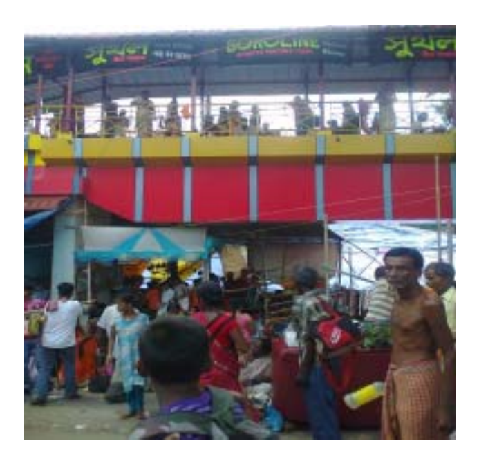
Fig 5: Foot bridge constructed near the Kamakhya temple

As a whole the main element of infrastructural development is the communication network and connectivity with the railway station, airport, bus stops etc which are well connected with the region.