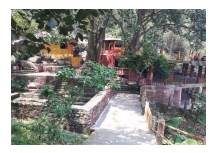
Fig 2: Staircases leading to Kotirlinga temple

the whole campus of the Kamakhya temple complex has been developed so that tourists can comfortably queue up. For security purpose CCTV cameras and metal detectors have been installed within the temple complex in addition to manual security system. The temples which are located in the hill slopes, like the Bhubaneswari temple, the Jai Durga temple, the Ban Durga temple, the Bagala Temple, the Kotirlinga temple, the Dwarpal Ganesh etc have been made accessible by constructing concrete staircases. Moreover, taking in view the safety measures, due to the locations of these temples in hill slopes, iron railings has been constructed along with the staircases. Drinking water facilities has been provided even to the remotest of the temples, like the Siddhi Ganesh temple.