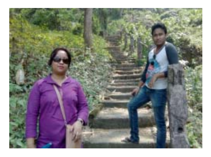
Fig 4: Staircases leading to Siddhi Ganesh temple (Near bank of Brahmaputra)