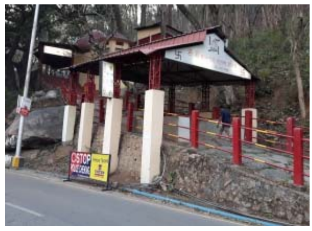
Fig 5: Staircases leading to Dwarpala Ganesh temple along with a resting shade for tourists