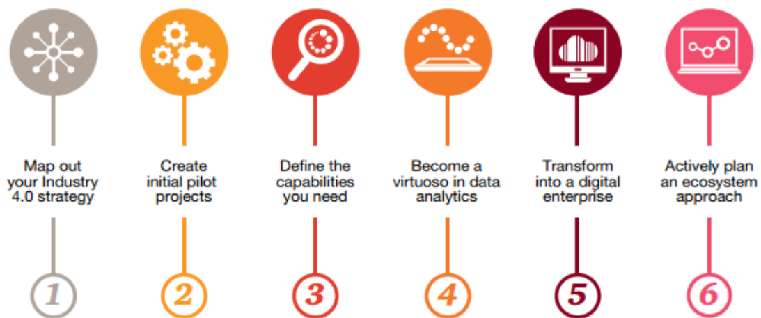
Fig. 2: Industry 4.0 application strategy step by step

Let us understand the Industry 4.0 application strategy step by step as below,