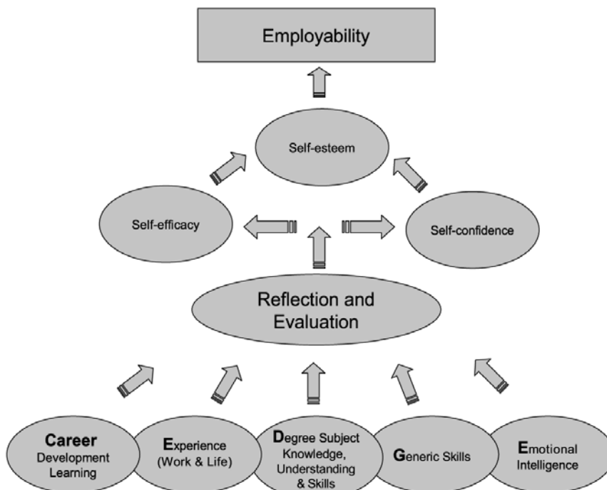
Fig 1 : USEM Model of employability

A lot of research has been made in the field of employability as this is the requirement of the era today. As per the increasing rate of literacy the requirement for employment is also increasing at a growing rate. There are many employability models suggested by researchers which gives us a better insight to the requirement a graduate should have to be employable.